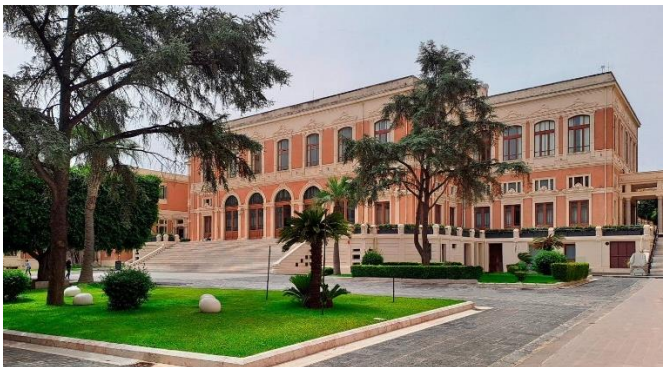
Outdoor garden (coffee breaks and lunches)