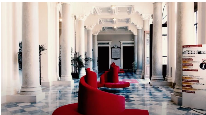
Building A hall (poster sessions)